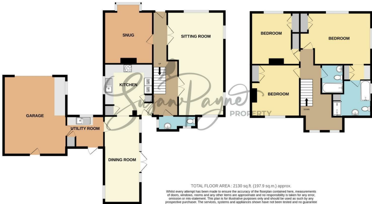
1ST FLOOR 780 sq.ft. (72.5 sq.m.) approx.

TOTAL FLOOR AREA : 2130 sq.ft. (197.9 sq.m.) approx. Whilst every attempt has been made to ensure the accuracy of the floorplan contained here, measurements of doors, windows, rooms and any other items are approximate and no responsibility is taken for any error, omission or mis-statement. This plan is for illustrative purposes only and should be used as such by any prospective purchaser. The services, systems and appliances shown have not been tested and no guarantee as to their operability or efficiency can be given. Made with Metropix ©2024